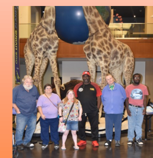
BYU Bean Museum

On behalf of the Board of Directors and staff, we hope the annual report gives you a glimpse of the impact Ability 1st Utah has made on the many lives of people with disabilities.