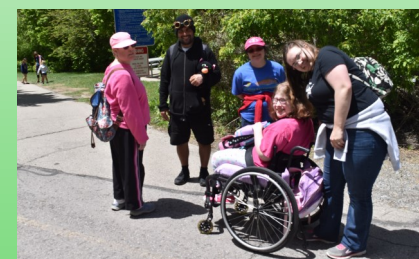
Trip to Bridal Veil Falls