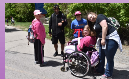
Trip to Bridal Veil Falls